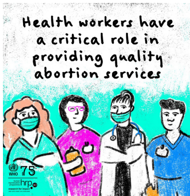
WHO, Health Workers & Abortion Service Graphic