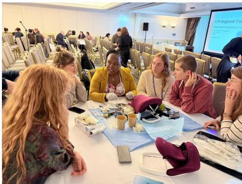
Rwandan midwives provide step-by-step guidance on manual vacuum aspiration (MVA), sharing their expertise to enhance practical skills and knowledge.