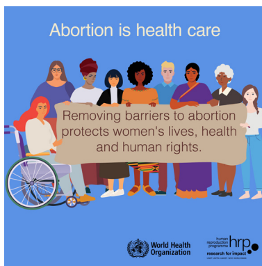
WHO, Abortion is Health Care Graphic