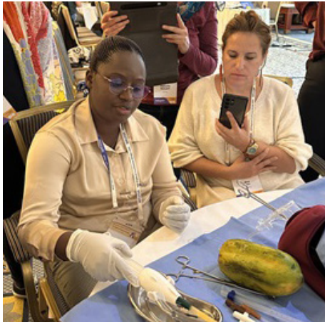
Rwandan midwives train European midwives in manual vacuum aspiration (MVA) abortion using papayas as simulation models.