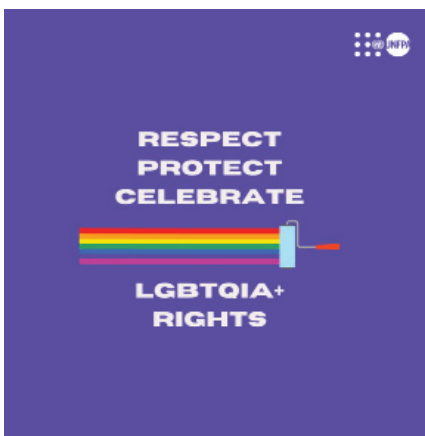
UNFPA X Post in Celebration of Pride, June 13, 2025

to say LGBTQIA+ rights are human rights: http://unfpa.org/htb/#PrideMonth " 74