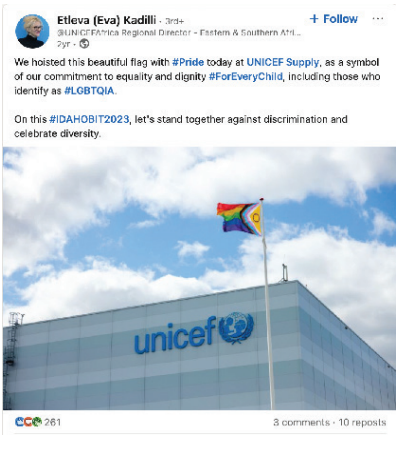
LinkedIn post from UNICEF Regional Director - Eastern & Southern Africa featuring a pride flag at UNICEF Supply