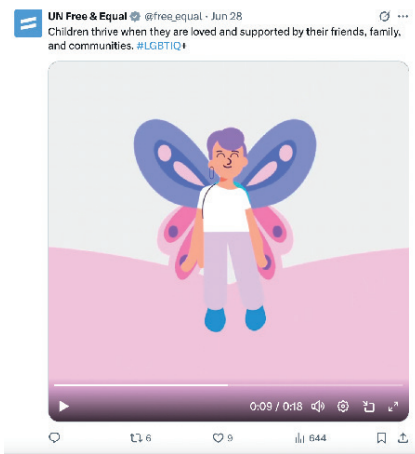
UN Free & Equal X Post, June 28, 2025