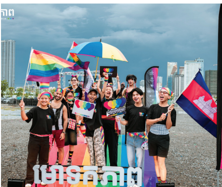
OHCHR X Post from July 1st, 2025

Report on protection against violence and discrimination based on sexual orientation and gender identity in relation to forced displacement (2025) – Prepared by the Independent Expert on protection against violence and discrimination based on sexual orientation and gender identity, the report mentions that "forcibly displaced lesbian, gay, bisexual, transgender and other gender-diverse (LGBT) persons are faced by a "double bind" of intensified attacks on their rights and rising, xenophobic, anti-migrant sentiments in many parts of the world." The report recommends that states "ensure safe, gender-appropriate accommodation for transgender and gender-diverse persons," the existence of "safe spaces and protection mechanisms for LGBT persons within refugee camps" and ensuring that "credibility assessments recognize the diverse ways in which LGBT persons claiming refugee and/or asylum articulate their experiences." 15