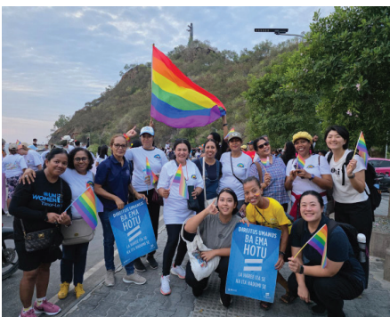
UN Free & Equal X Pride Post , July 5, 2025