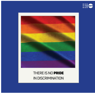
UNFPA X Post in Celebration of Pride, June 8, 2025