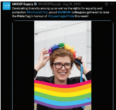
UNICEF X posts